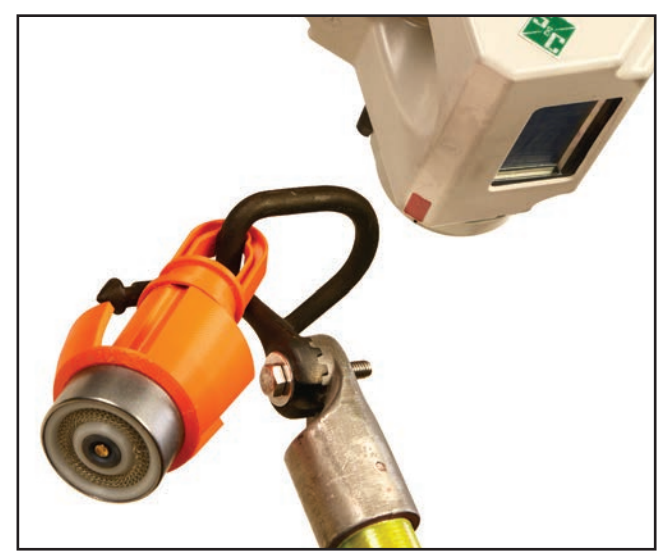
Figure 10. Lower the module and remove from the Talon tool.