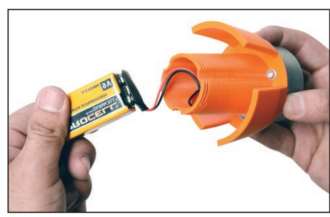
Figure 13. Train the wires inside the body of the module and replace the pull-ring.