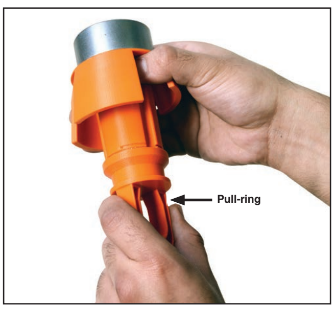
Figure 11. Unscrew the pull-ring from the base of the module.

STEP 1. Unscrew the pull-ring from the base of the module. See Figure 11.