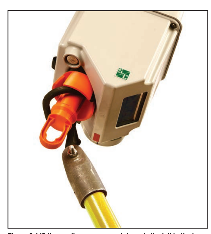
Figure 6. Lift the cordless power module and attach it to the base of the TripSaver II recloser.