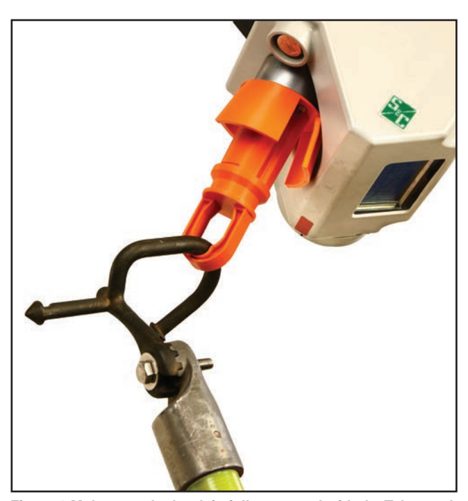
Figure 8 Make sure the hook is fully engaged with the Talon tool.