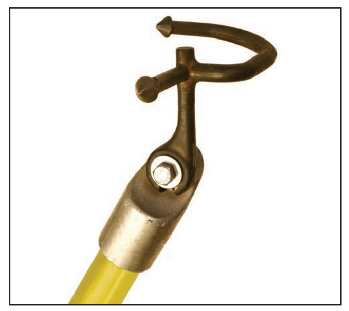
Figure 2. Attach the Talon tool to the hookstick.