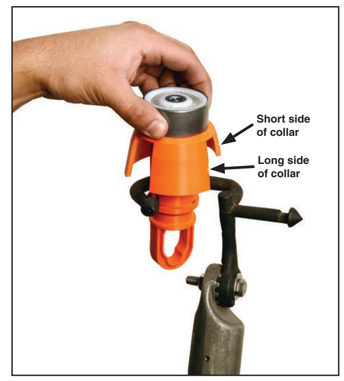
Figure 3. Place the power module on the Talon tool.