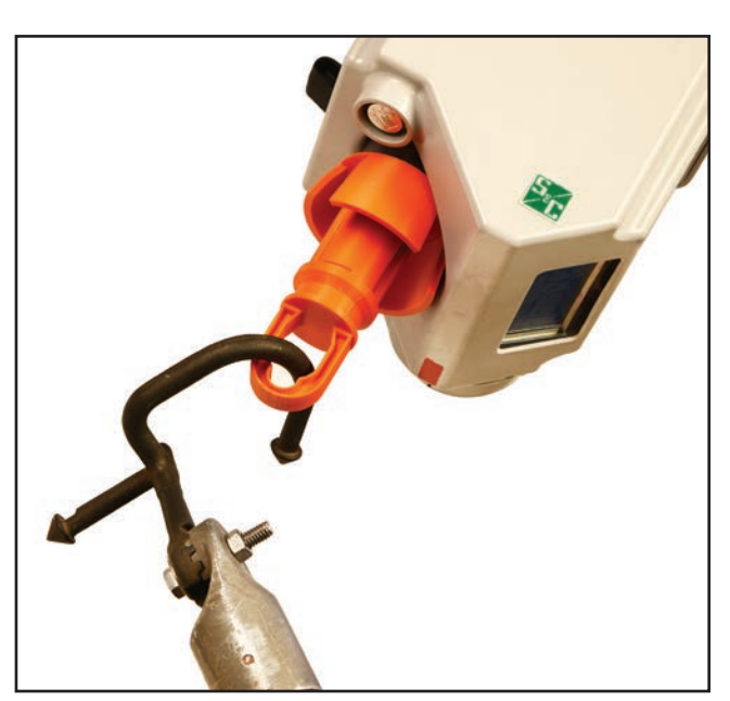
Figure 7. Hook the Talon tool through the pull-ring on the module.

STEP 3. Store the cordless power module in its case. See Figure 1 on page 7.