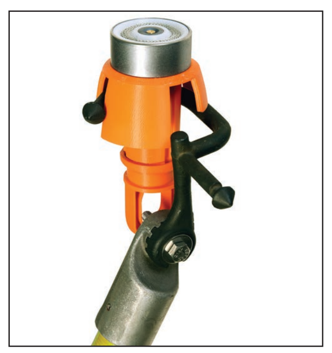
Figure 4. Make sure the cordless power module is secure on the talon tool.