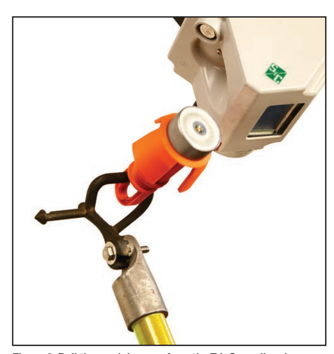
Figure 9. Pull the module away from the TripSaver II recloser.