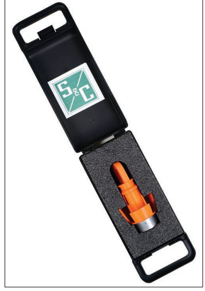
Figure 1. Cordless power module in carrying case.

The TripSaver II Cutout-Mounted Recloser Cordless Power Module comes in a foam-padded carrying case. See Figure 1. A 9-V battery is included. When not in use, the cordless power module should be stored in its carrying case. The carrying case should be stored in a protected area, such as inside of a truck or indoors in a service center. Use care not to drop the cordless power module during installation and removal.