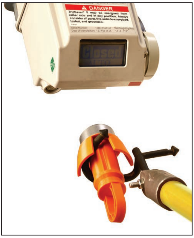
Figure 5. Keep the cordless power module level while lifting.