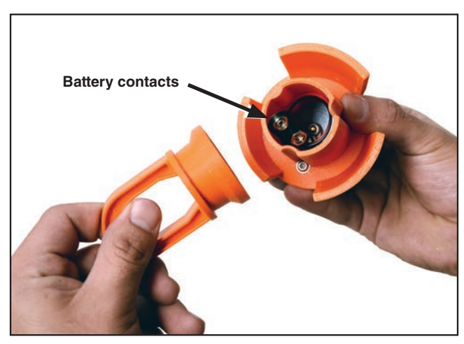
Figure 12. The battery compartment inside the cordless power module.