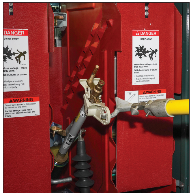
Figure 4. A Grappler tool positioned for fuse removal.