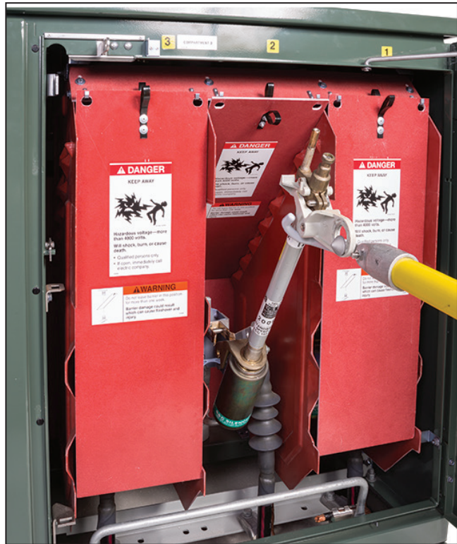
Figure 5. Installing (or removing) fuse using Grappler.

Release the Grappler tool from the pull-ring. Use the Grappler tool to push against the fuse to make sure complete fuse closure is attained.