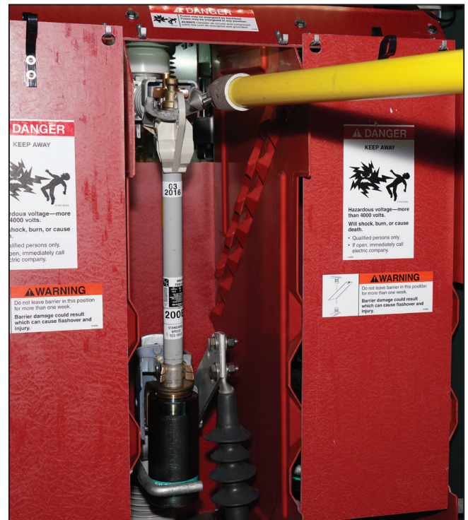
Figure 3. A Grappler tool, as positioned for an opening (or closing) stroke, with the longer prong inserted in the fuse pull-ring.

▲ Although the operations as described in this section refer simply to “fuses,” the procedures apply to Type SML-20 and SML-4Z Power Fuses.