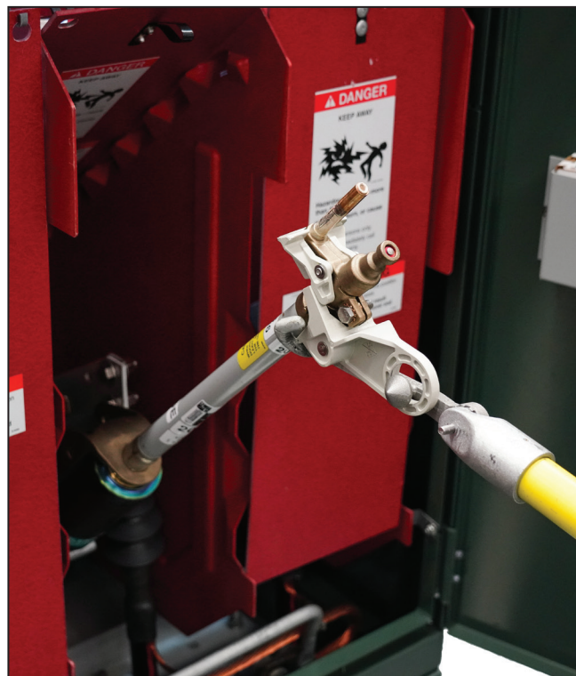
Figure 6. Closing the fuse.