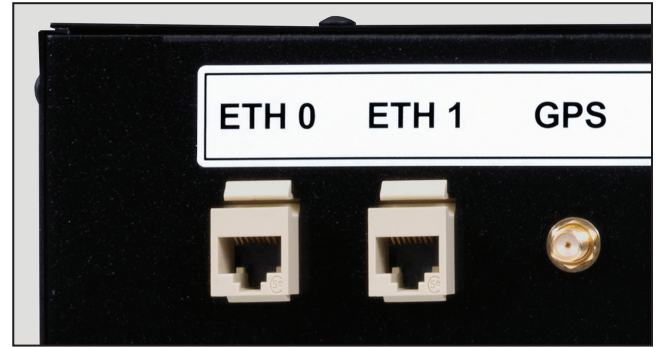
Figure 3. The Ethernet and GPS ports.

S&C recommends the control power source be supported by an uninterruptable power supply with at least one hour capacity.