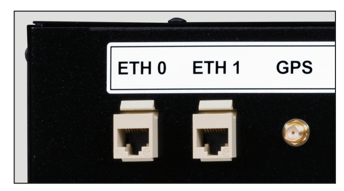
Figure 3. The Ethernet and GPS ports.

S&C recommends the control power source be supported by an uninterruptable power supply with at least one hour capacity.