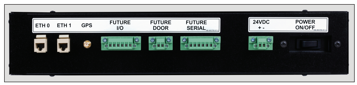
Figure 1. Rear panel of the rack-mounted GridMaster controller.

Familiarize yourself with the parts of the GridMaster controller. See Figure 1.