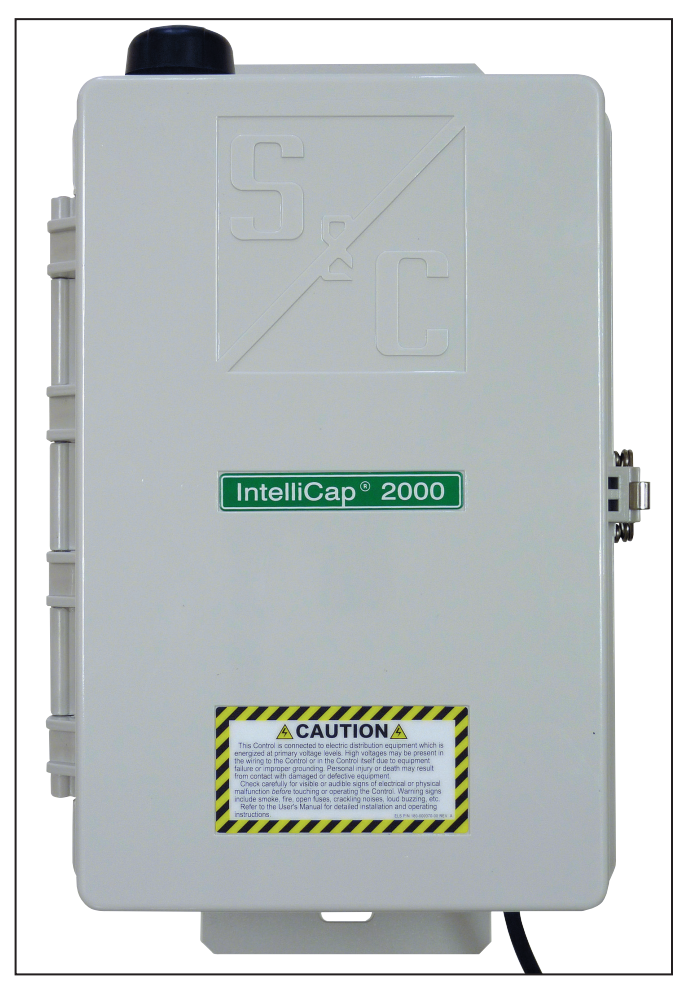
Figure 1. IntelliCap 2000 control enclosure.

The IntelliCap 2000 control enclosure and parts are shown in Figure 1 and Figure 2 on page 7.