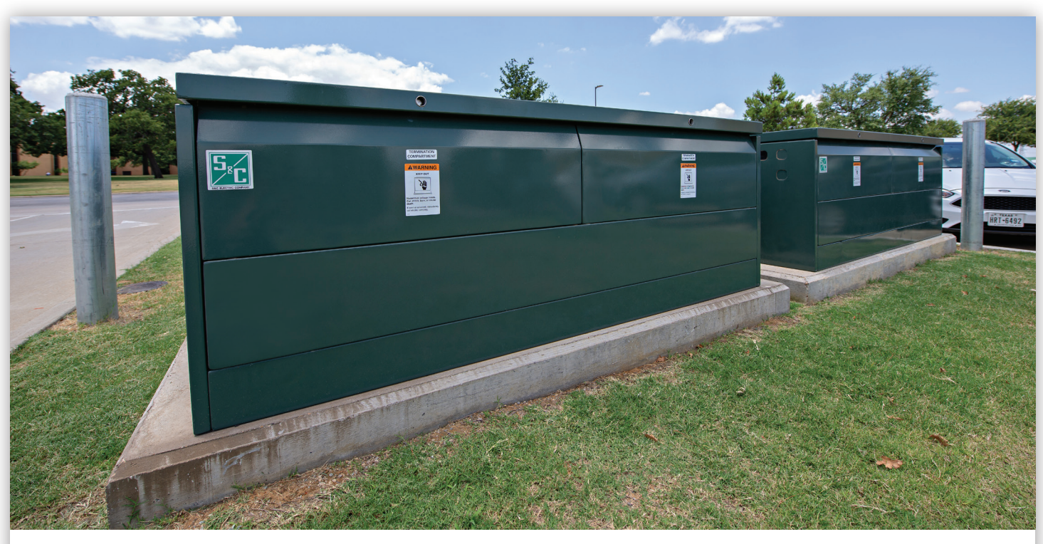
FIGURE 1. Two pad-mount Vista switchgear units.

Pad-Mounted Style. This style improves aesthetics and reduces real-estate requirements—especially at 34.5 kV, where air-insulated gear is too large to be practical in many applications.