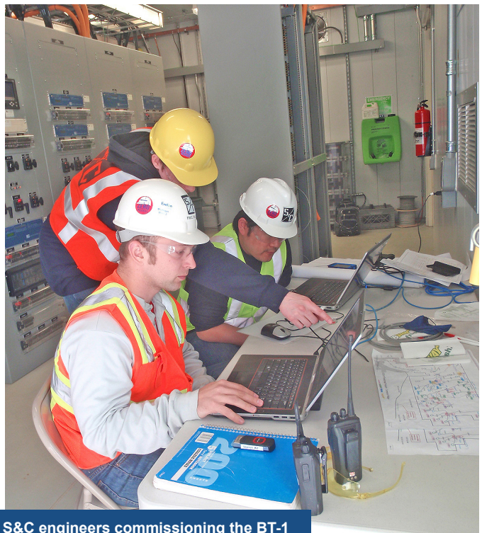
S&C engineers commissioning the BT-1 SCADA system.