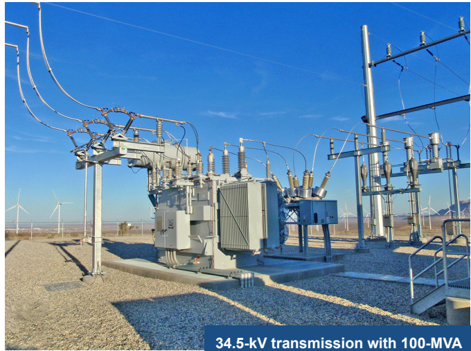
34.5-kV transmission with 100-MVA transformer.

The expanded-capacity wind farm became operational in 2012, supplying an additional 102 MW of clean energy to California's grid . . . enough to power approximately 26,000 homes.