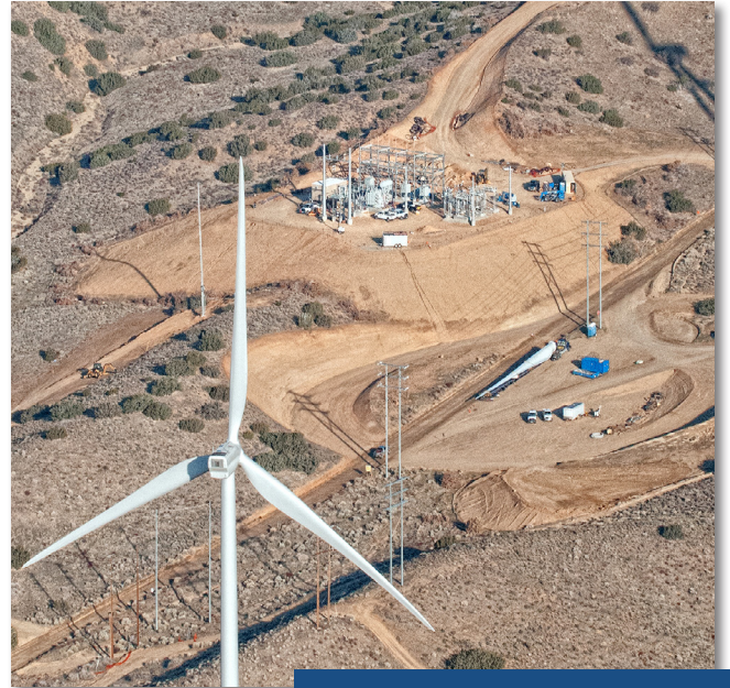
Aerial view of the BT-1 interconnection substation.

S&C immediately began procurement and construction of all the electrical systems necessary to connect the new wind turbines to the grid, including the overhead and underground collector systems, the substations, control buildings, transmission cables, and transmission tie-in. S&C also supplied 38-kV Wind Turbine Style Vista® Switchgear for the collector circuits of the wind turbines.