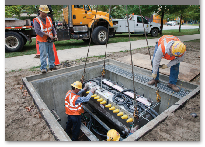
Installation of S&C UnderCover™ Style Vista Underground Distribution Switchgear.