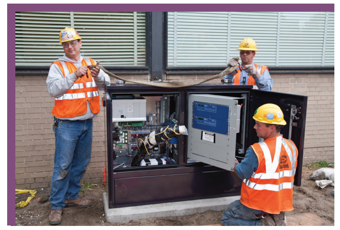
Installation of S&C Remote Supervisory Vista Underground Distribution Switchgear for High-Speed Fault-Clearing System.