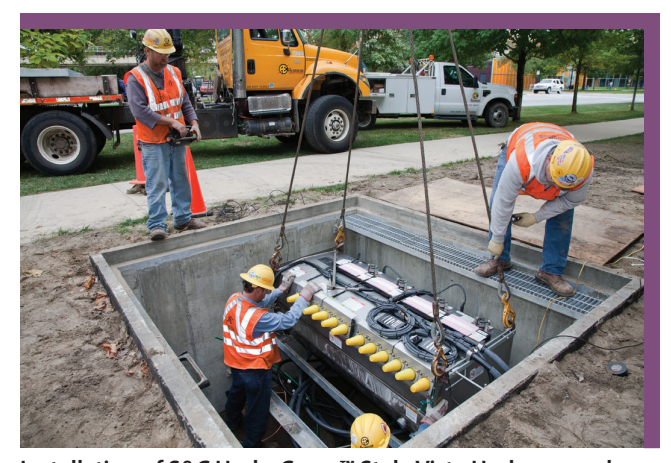
Installation of S&C UnderCover™ Style Vista Underground Distribution Switchgear.