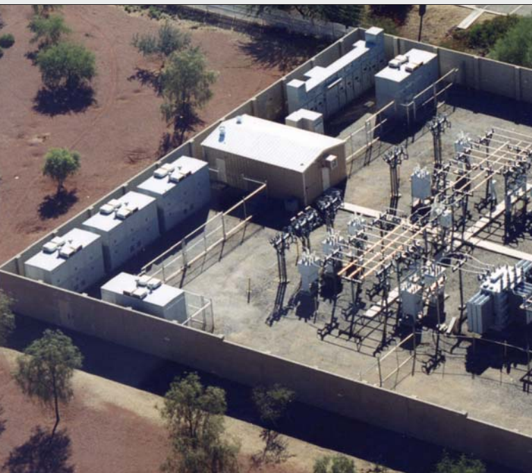
S&C PureWave UPS System rated 12,500 kW @ 12.47 kV protecting a large critical load

It's ideal for high-density data centers. It will let you meet Tier III or Tier IV electrical requirements as well as Class A or Class B cooling requirements. Only the PureWave UPS System can be installed outdoors without modification, saving valuable interior floor space and reducing cooling loads.